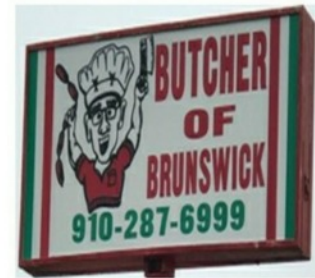
The Butcher of Brunswick