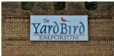
The Yard Bird Emporium