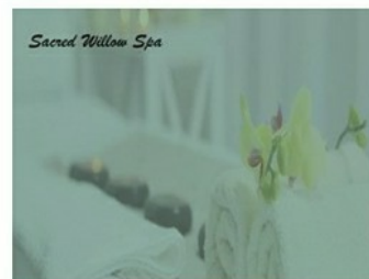
Sacred Willow Spa