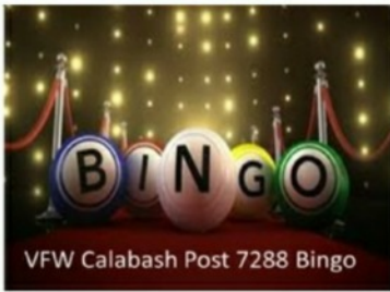
VFW Calabash Post #7288

Remember to say THANK YOU to our Sponsors & let them know you're from VFW Calabash Post #7288!