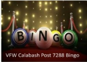
VFW Calabash Post #7288

Remember to say THANK YOU to our Sponsors & let them know you're from VFW Calabash Post #7288!