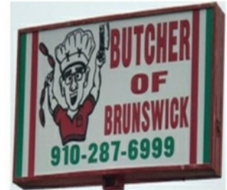
The Butcher of Brunswick