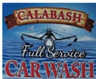
Calabash Car Wash