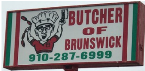
Butcher of Brunswick

Remember to say THANK YOU to our Sponsors & let them know you're from VFW Calabash Post #7288!