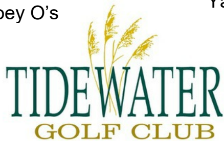
Tidewater Golf Club