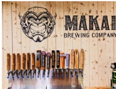
Makai Brewing Co.