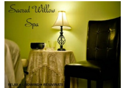
Sacred Willow Spa