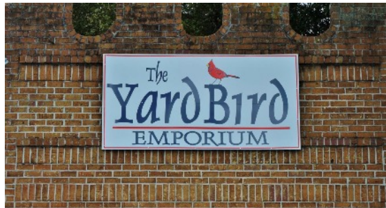
Yard Bird Emporium