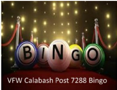
VFW Calabash Post 7288 Bingo