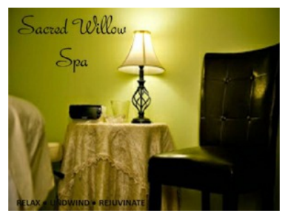
Sacred Willow Spa