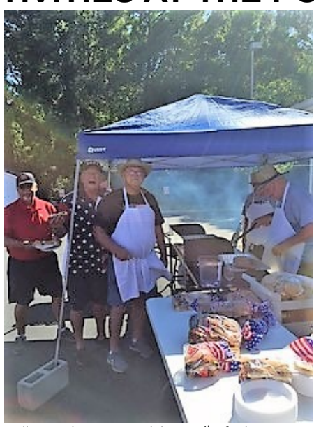
Grilling at the Post to celebrate 4th of July