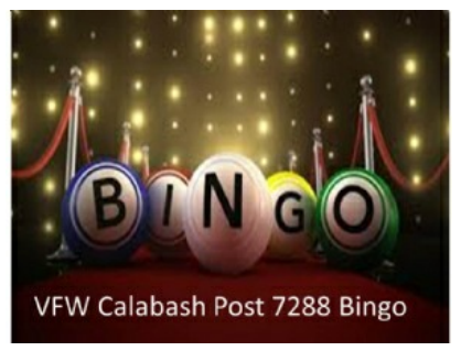
VFW Post 7288 Bingo