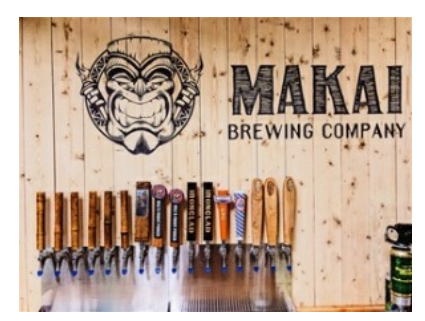
Makai Brewing Co.