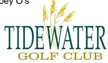
Tidewater Golf Club