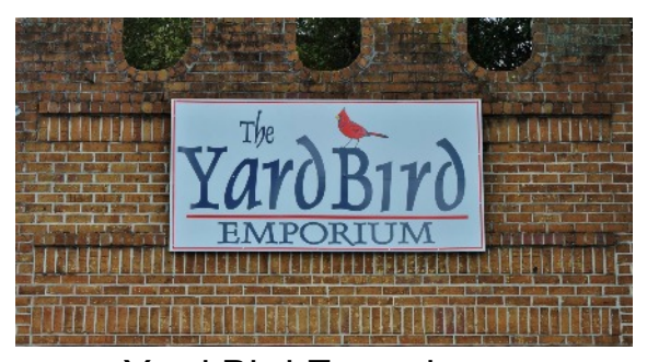
Yard Bird Emporium